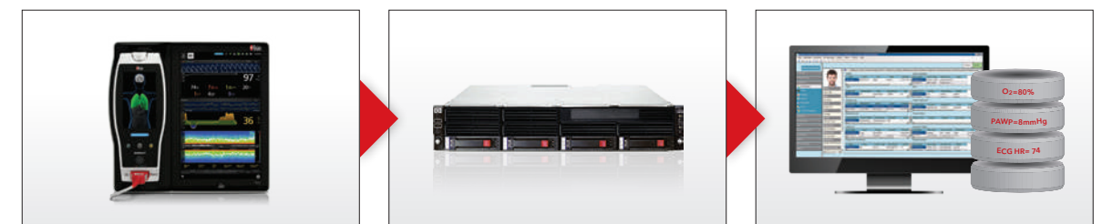
Data from Root and connected third-party devices

Integrate data from Root and third-party devices using Iris® ports for automated charting in EMRs.